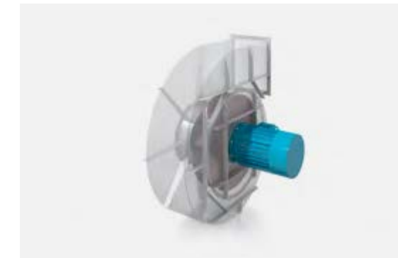
MAE Direct drive, mounted fan.