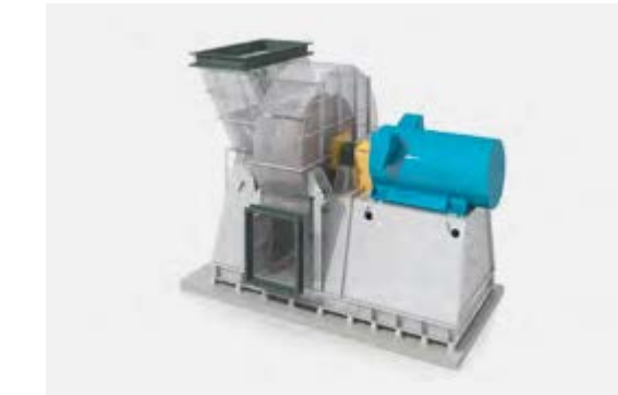
KXA Drive via coupling, integrated suction box.