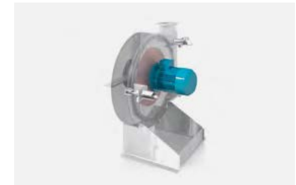
MSE Direct drive, hinged housing cover.