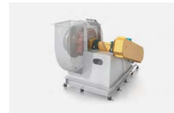
RGE Belt drive, base frame, lateral motor.