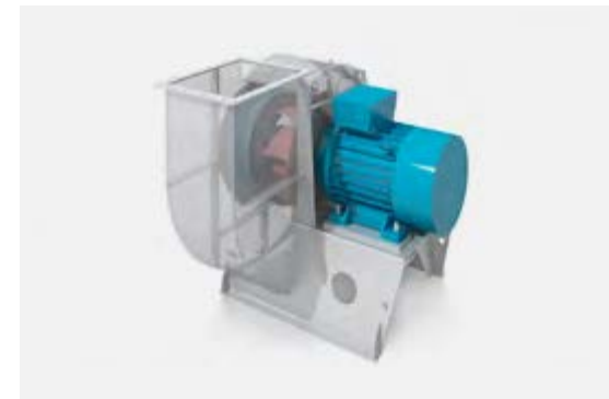
MXE Direct drive.