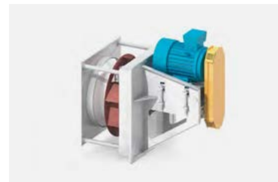
REE Belt drive, built-in fan without housing.