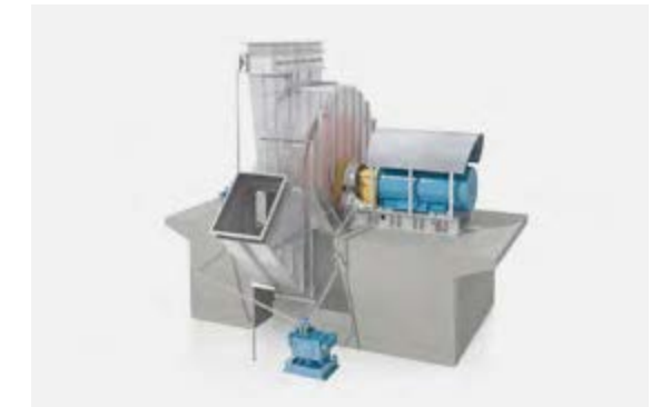
KBA Drive via coupling, concrete foundation, impeller centre mounted, single inlet.