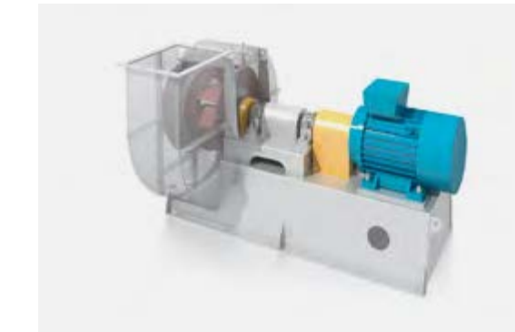
KXE Drive via coupling.