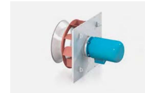
MEE Direct drive, built-in fan without housing.