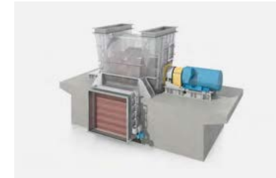
KBZ Drive via coupling, concrete foundation, impeller centre mounted, double inlet.