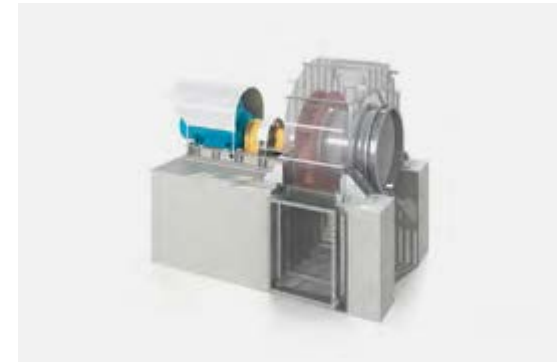
KBE Drive via coupling, concrete foundation, overhung impeller, single inlet.

Discover the complete range of types and design options: reitzgroup.com