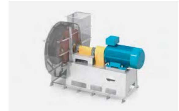
KXS Drive via coupling, hinged housing cover.