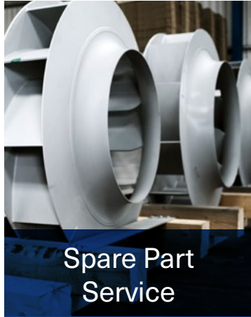
Spare Part Service